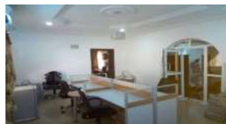
The Office Workstations