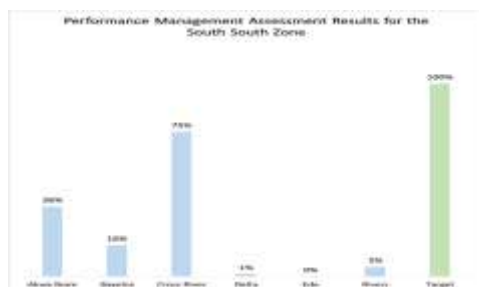
1 st Quarter PMA Result for SSZ

States are assessed and measured under 4 system indicators: (1) Review of action plans, (2) development and updating of action plans, (3) evidences of continuous analysis of weaknesses in delivering primary health care services and (4) having a designated lead performance management officer (state performance manager -SPM). The target for all states is 100% and States that achieve this is at the end of the 4 th quarter is incentivized with $160, 000 performance bonuses.