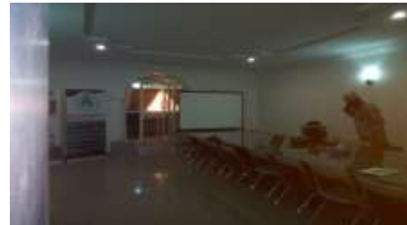
The Conference Room