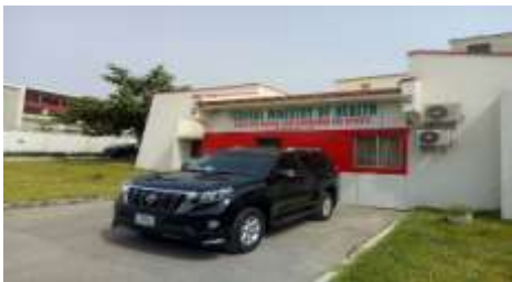
The Office building