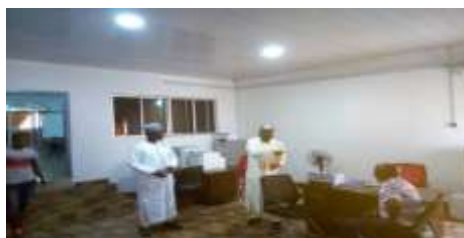
The Front Office