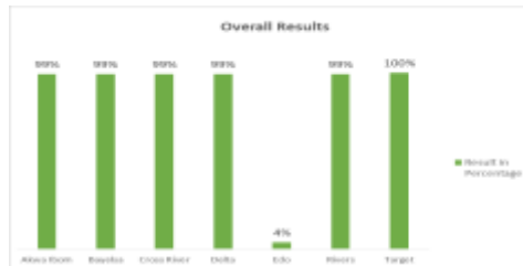
3 rd Quarter PMA Result for SSZ